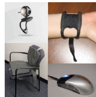
Figure 2. Sensors used in the classroom (clockwise): Facial Expression Sensor; Conductance Bracelet, Pressure Mouse and Posture Analysis Seat.

Twenty-five sets of each sensor were manufactured for simultaneous use in classrooms in Massachusetts and Arizona. The four sensors, shown in Figure 2, include: a facial expression recognition sensor that incorporates a computational framework to infer a user's state of mind [20] called the MindReader software (provides a probability of a student's being concentrated, interested and a few others, at any given time); a wireless conductance bracelet based on an earlier glove that sensed skin conductance, developed at the MIT Media Lab; a pressure mouse to detect the increasing amounts of pressure that students place on their mice related to increased levels of frustration [21]; and low-cost/low resolution pressure sensitive seat cushions and back pads with an incorporated accelerometer to measure elements of a student's posture and activity.